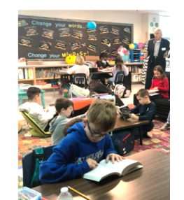
Stafford Rotary Club ~ Giving dictionaries to excited 3rd grade students!

District 7610's Membership Committee is creating a Rotary Roadshow to take to community events to promote and explain Rotary. We need your support in order to showcase community service projects that your club has found meaningful. This means - we need pictures that reveal hands-on actions taken by Rotarians as they actively engage with their neighbors and communities. Pictures should be clear, NOT posed, and have a one sentence tag with club name and brief description of the project. No promises on what will be used in this slide show, but we would like to have as many different Rotary Clubs represented as possible. To be considered, we must receive these photos ASAP – now would be good, but the deadline is Aug 15. Send to Katie Larson at bluejaykk@gmail.com. Thank You!!!